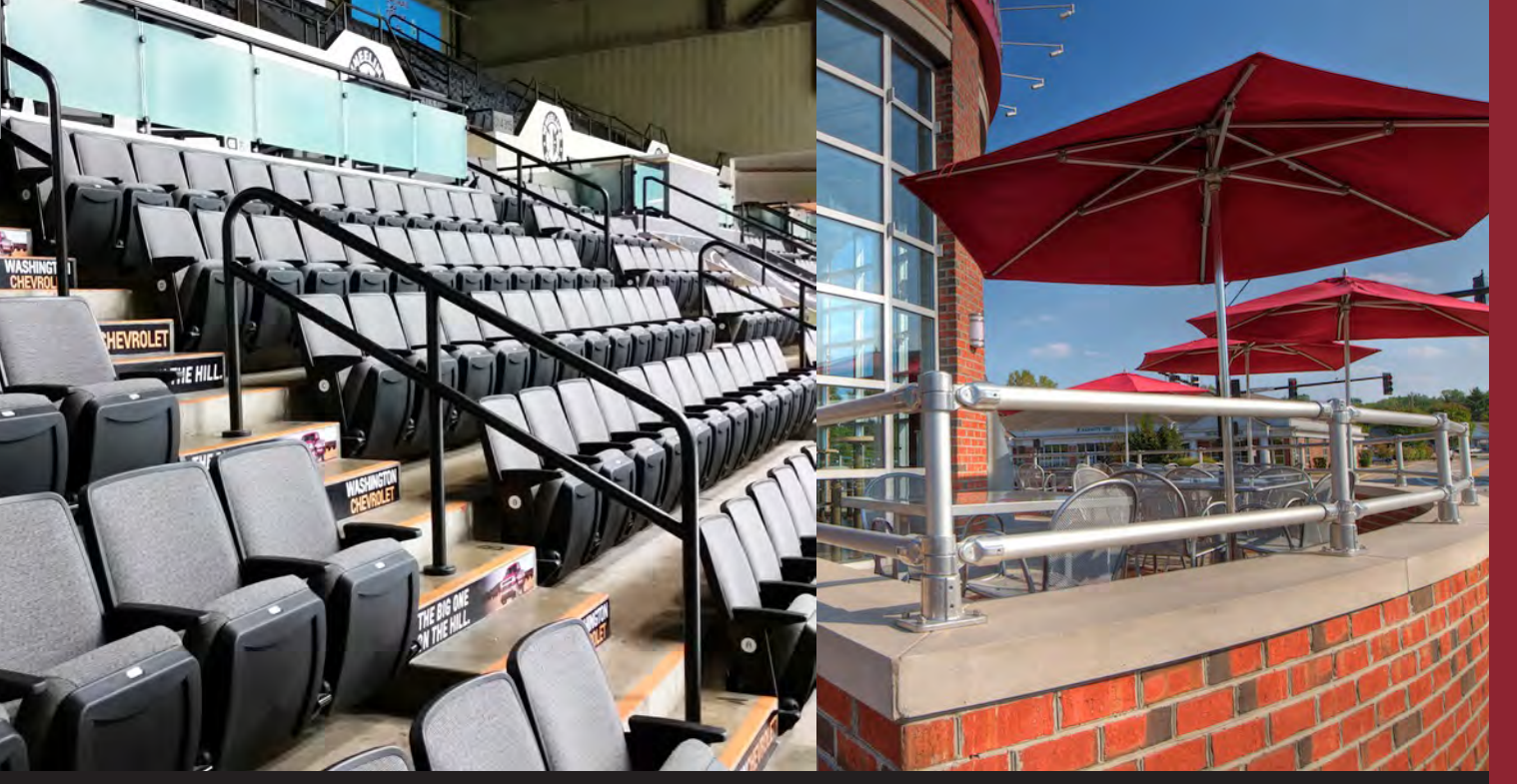
Mid-Rails for Grandstands/Bleachers